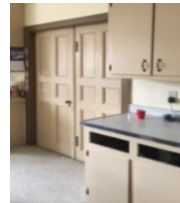
Above: Picture from February