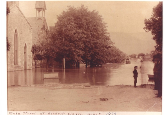
Flood of 1879

St. Mark's began its life in the 1820s. We have a hand-written letter of incorporation dated 1824 that we would like to display in our new gallery, which will be the hallway you enter from Water Street. We have pictures of the construction of the "new St. Mark's church" in the late 1880s, and we have pictures of church life from more than a century ago. Imagine my surprise when I found this photo of the flood of 1879 in the files.