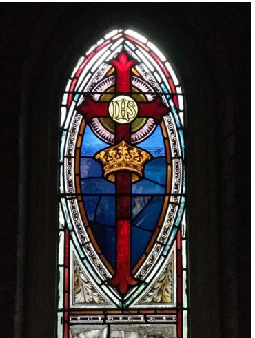
"The Cross and the Crown"

Let's face it: "no cross, no crown" – in other words, we can't know the true joy of Easter without having first known the agony of the cross, which we experience most fully during the Three Sacred Days (Maundy Thursday, Good Friday and Holy Saturday). The beautiful window in our narthex (the entrance to the church) illustrates the "cross and crown" in a vivid red color.